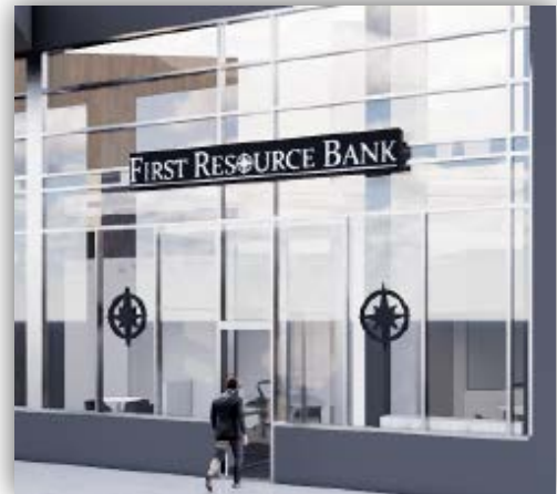
Model of the Exterior of the New Branch Location

Twin Cities, MN – First Resource Bank, a growing Twin Cities bank focused on businesses and entrepreneurs, is pleased to announce the opening of a Minneapolis, MN branch location in the summer of 2019, subject to regulatory approval. The Branch will be located on the street level of the new Ironclad Building at the intersection of S Washington Ave and Chicago Ave near US Bank Stadium. This will be the fifth full service branch for First Resource Bank.