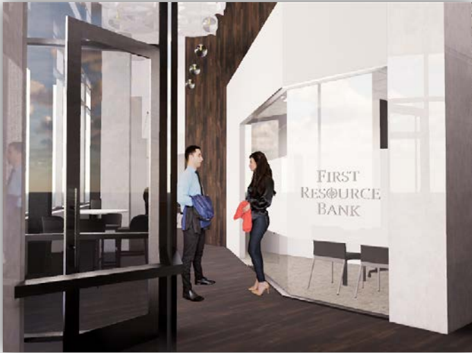
Entry with Logo